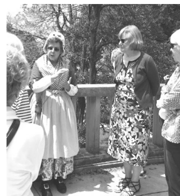
TSCOR travelers listen to a guide dressed in period costume during the Culinary Tour of Annapolis this past June.