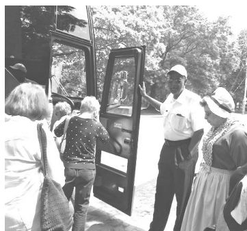
All aboard! Travelers boarding the motorcoach on the Culinary Tour of Annapolis.