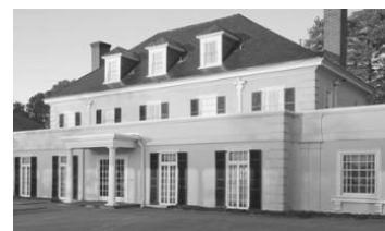
TSCOR's 35th Celebration will be held at the U of R Jepson Alumni Center.

volunteers. All volunteers and members will receive an invitation, via email or regular post, so keep your eyes