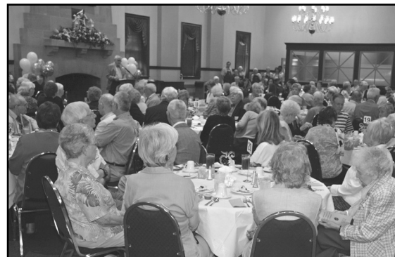
A snapshot from the 30th Anniversary Birthday Bash held in 2014.