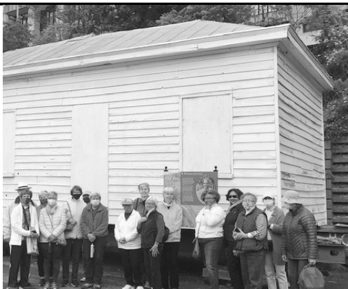
The walking tour visits Lumpkin's Jail in Shockoe Bottom.